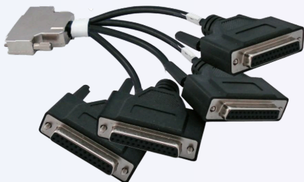
4-port DB25 Octopus Cable Included.