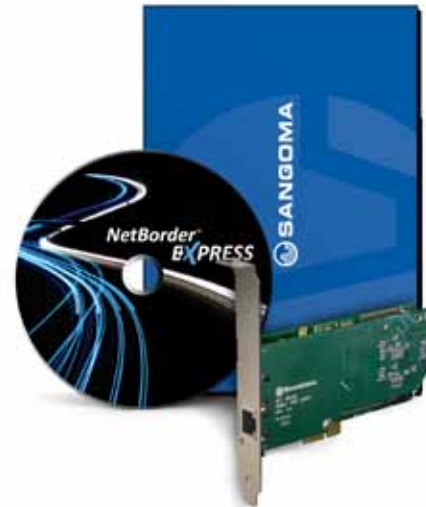
Single Port T1/E1 NetBorder Express Gateway Card with PCI-Express Interface. Supports up to 30 Simultaneous Calls. (Part Number: NBE030-F-A101DE)

Available for analog FXO and T1/E1 digital interfaces, NetBorder Express Gateway Cards are an excellent value for installations ranging anywhere from 4 to 240 simultaneous calls. For larger systems, several gateway cards can be combined in the same server to support up to 960 simultaneous calls.